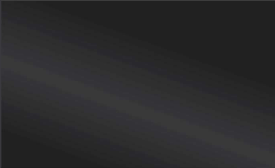
3M FX ST Automotive Window Films