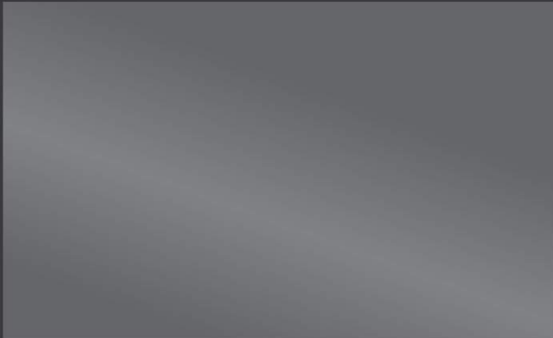
3M FX ST Automotive Window Films